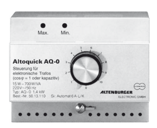
AQ-0 0,7KW DIN rail type