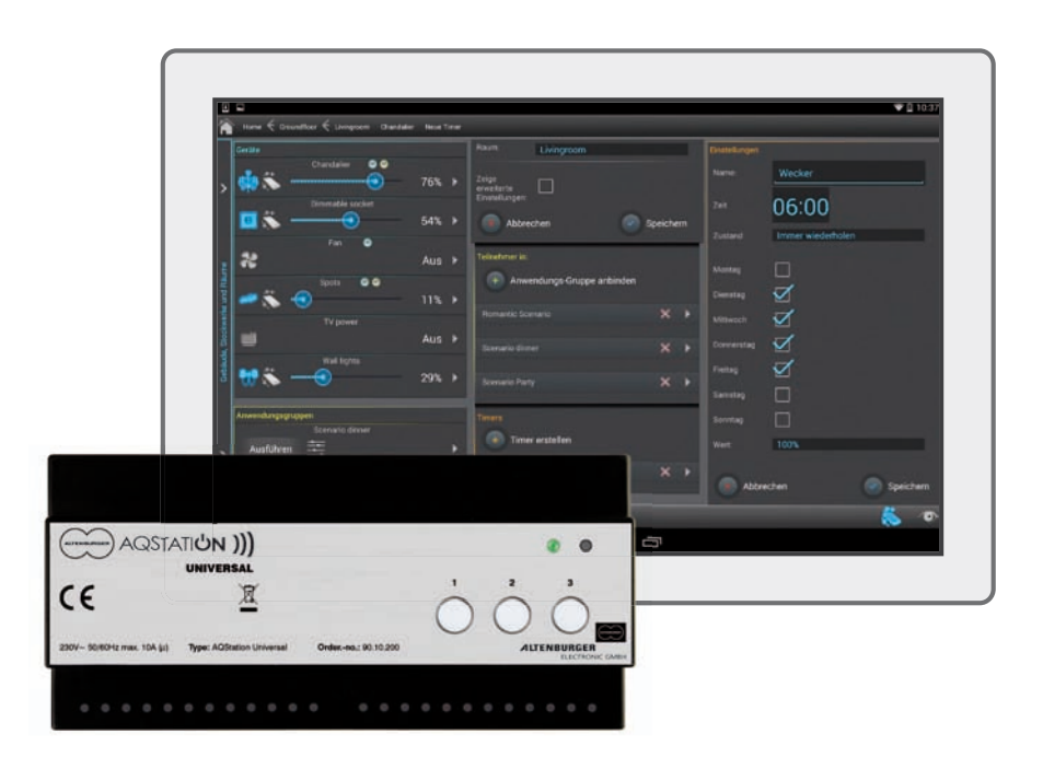
AQStation Universal with Tablet

In case of higher loads being required DIN rail dimmers with load capacities up to 2 KW and Thyristor dimmers up to 8 KW are available.