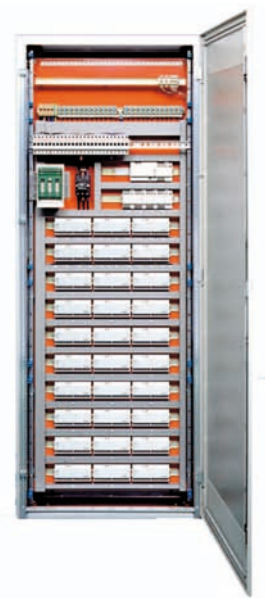
DIN rail cabinet with AQ dimmers

In case of higher loads being required DIN rail dimmers with load capacities up to 2 KW and Thyristor dimmers up to 8 KW are available.